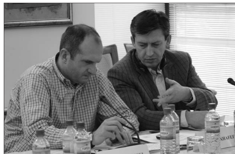
Left to right: Vlado Buckovski and Musa Xhaferri.