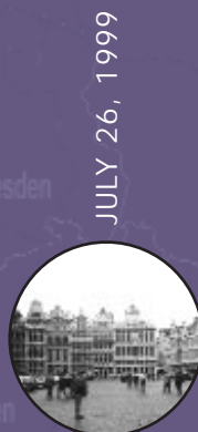
JULY 26, 1999 BRUSSELS, BELGIUM

15 Chambers Street Princeton, New Jersey 08542-3707, USA Telephone: (609) 683-5666 Fax: (609) 683-5888 E-mail: ethnic@compuserve.com http://www.netcom.com/~ethnic/per.html